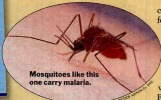
Mosquitoes like this one carry malaria.

Malaria is caused by a tiny parasite that lives in the gut and saliva of mosquitoes in nations where the disease flourishes. When an infected mosquito bites someone, the microscopic parasites slip into the person's bloodstream. Usually