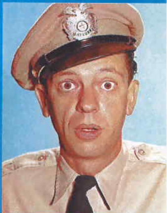
FAREWELL DON KNOTTS