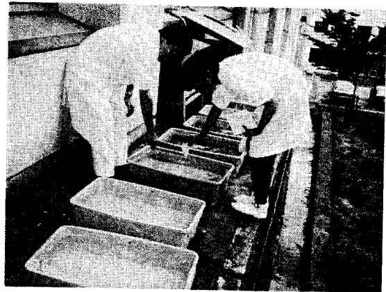
Fig. 1 Treatment of polyethylene containers in the campus with 0.5% pyriproxyfen granules.

When pupae were not collected in sufficient number, 3rd and 4th instar larvae were collected with field water. At site 5, 8 and 9 of Tables 2 and 3 few pupae were collected throughout the survey, so that only the larval isolate method was utilized. Twenty-five larvae each were placed in a cup with 100 ml of field water, from where the larvae were