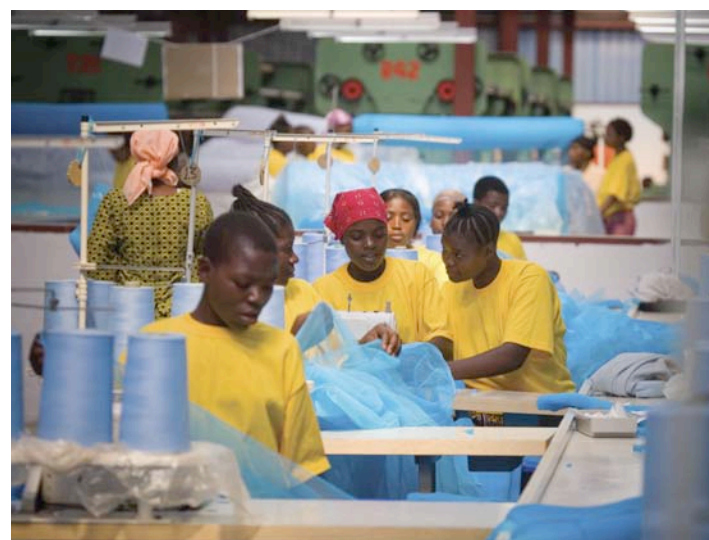
Manufacture of Olyset LLIN nets in Arusha, Tanzania ©MHallahan/Sumitomo Chemical – Olyset® Net

One of the greatest challenges facing Africa in the fight against malaria is drug resistance. Resistance to chloroquine, the cheapest and most widely used antimalarial, is common throughout Africa (particularly in southern and eastern parts of the continent). Resistance to sulfadoxine-pyrimethamine