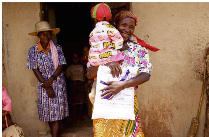
Distribution of Olyset bed nets in Madagascar ©MHallahan/Sumitomo Chemical – Olyset® Net

(SP), often seen as the first and least expensive alternative to chloroquine, is also increasing in east and southern Africa. Over the past decade, a new group of antimalarials – the artemisinin compounds, especially artesunate, artemether and dihydroartemisinin – have been deployed on an increasingly large scale. These compounds produce a very rapid therapeutic response and are active against multi-drug resistant P. falciparum and are well tolerated by the patients. To control malaria efficiently, a co-ordinated approach is required, this includes prevention through control of the vector mosquitoes, early diagnosis and treatment through a good health care system and provision of anti-malaria drugs. Since the most vulnerable groups of the population are pregnant mothers and children <5 years old, this group must be provided with better antenatal care and education to protect the young children. While work and trials continue on the development of a malaria vaccine, an effective final product is still a long way off, so we have to rely on and use the tools we have available today efficiently.